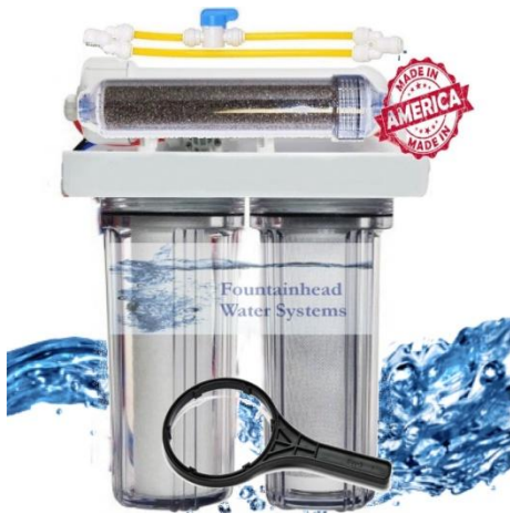
4 STAGE RO DI SYSTEM